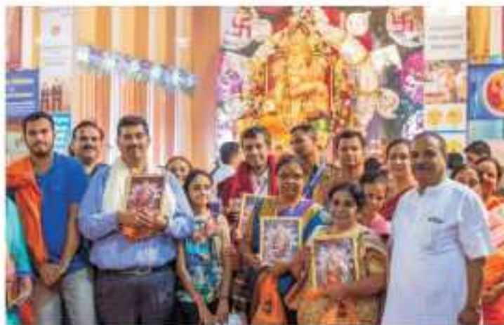
Managing Committee members of Sabha, with family, received the blessings of Lord Ganesha at the Ganeshotsav's organized by G.S.B. Seva Mandal and Wadala GSB Sarvajanik Ganeshotsav Samiti.