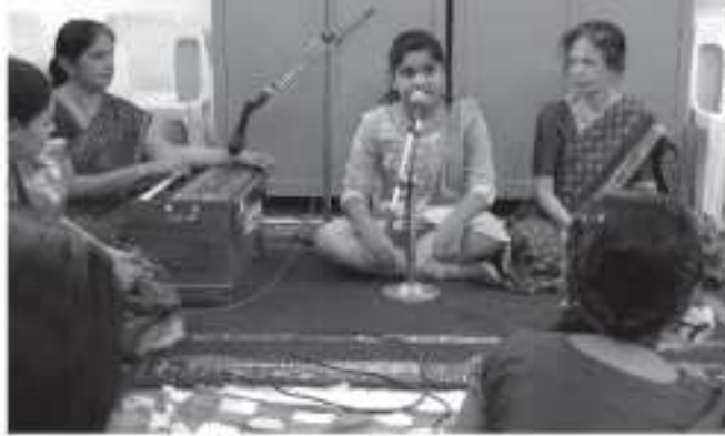
1st Prize winner in Junior group