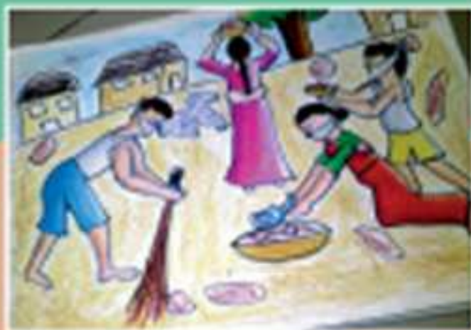
Swachh Bharat Abhiyan by Omkar Uday Shanbhag 12 years