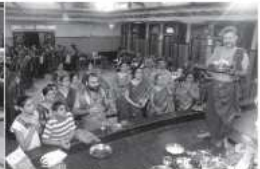
Praying for welfare and prosperity for Sabha