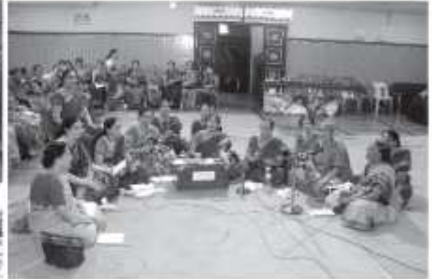
Bhajans by Mahila Shakha Bhajan Class