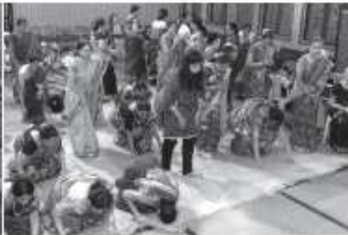
Offering 108 Pradakshina to the Goddess