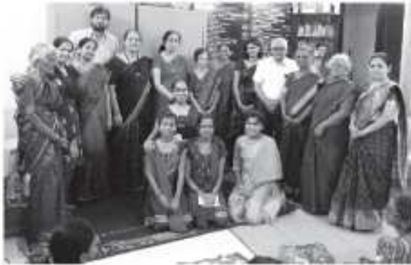
One for the Photo-all the winners and the judges