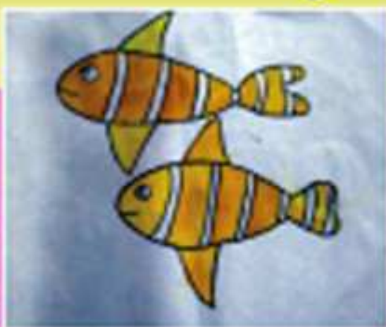
Atimanyu Telang 9 years