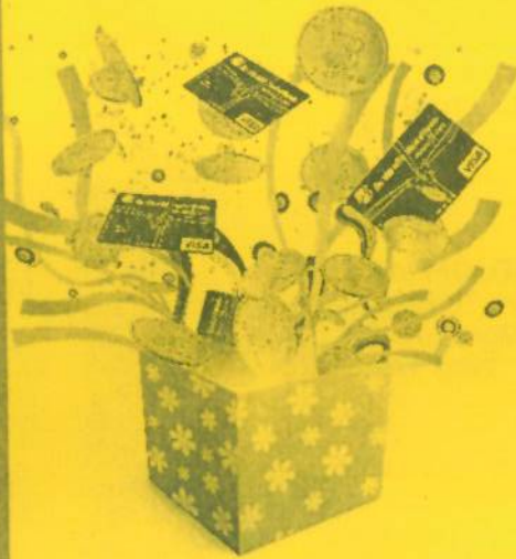
24 CARAT GOLD COIN