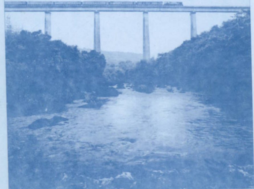
Konkan Railway viaduct, Asia's highest.

For engineers: A benchmark in innovation. For a traveller: Fewer hours travelled. More hours lived. For the record: Asia's highest. For Konkan Railway: Accolades. For us: Imagineering, as usual.