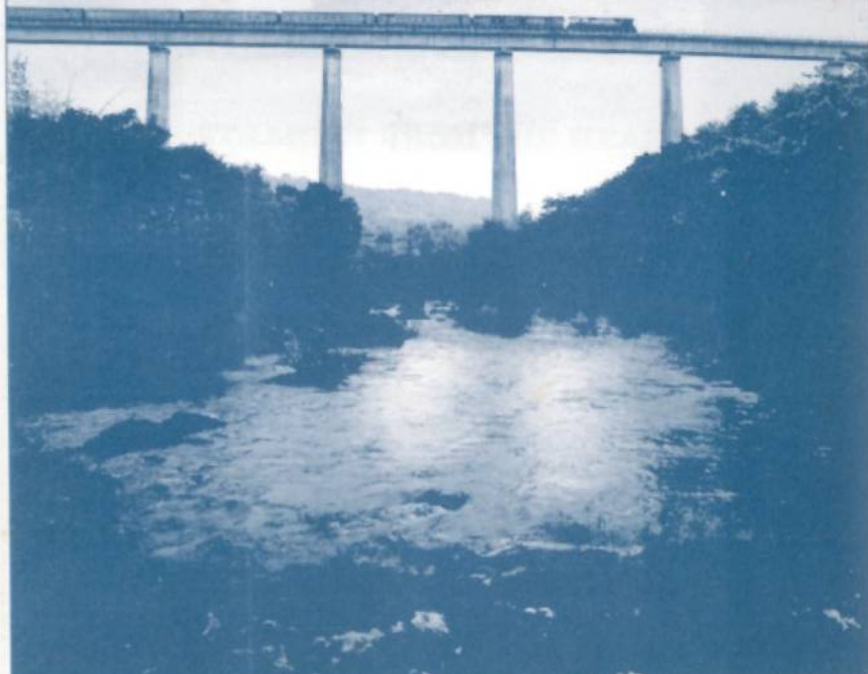
Konkan Railway viaduct, Asia's highest. Created by Team L&T

For engineers: A benchmark in innovation. For a traveller: Fewer hours travelled. More hours lived. For the record: Asia's highest. For Konkan Railway: Accolades. For us: Imagineering, as usual.